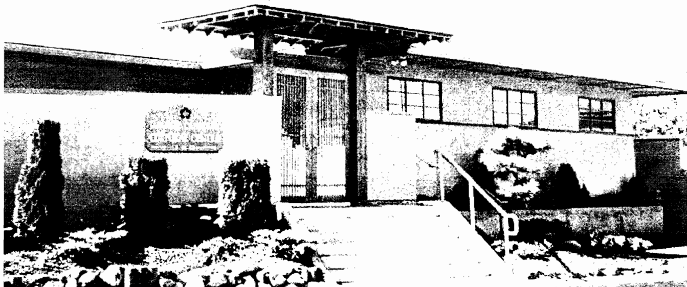
Kamloops Japanese Canadian Cultural Centre.

part in various Centennial activities. The KJCA is a social, cultural organization whose purpose is to foster fellowship amongst its members and participate in the furtherance of Japanese heritage.