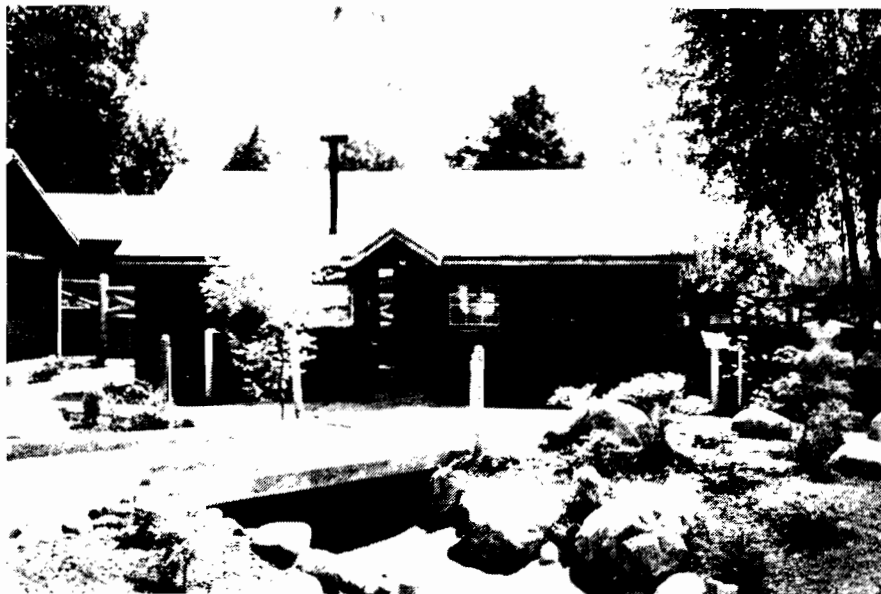
Nikkei Internment Memorial Centre. (Frank Kamiya photo, 1994)

creator of this project first met in a hall on this site in 1943. This is the only internment camp organization still in operation. The NIMC aims not only to enrich our understanding of internment history, but also to emphasize the fragile nature of civil rights for all Canadians. ☀