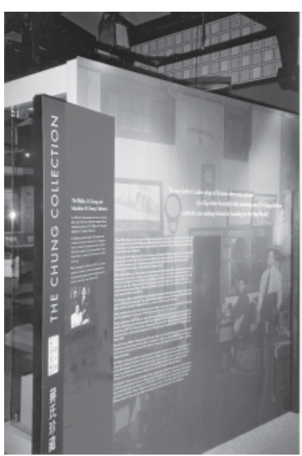
Chung Collection information panel.