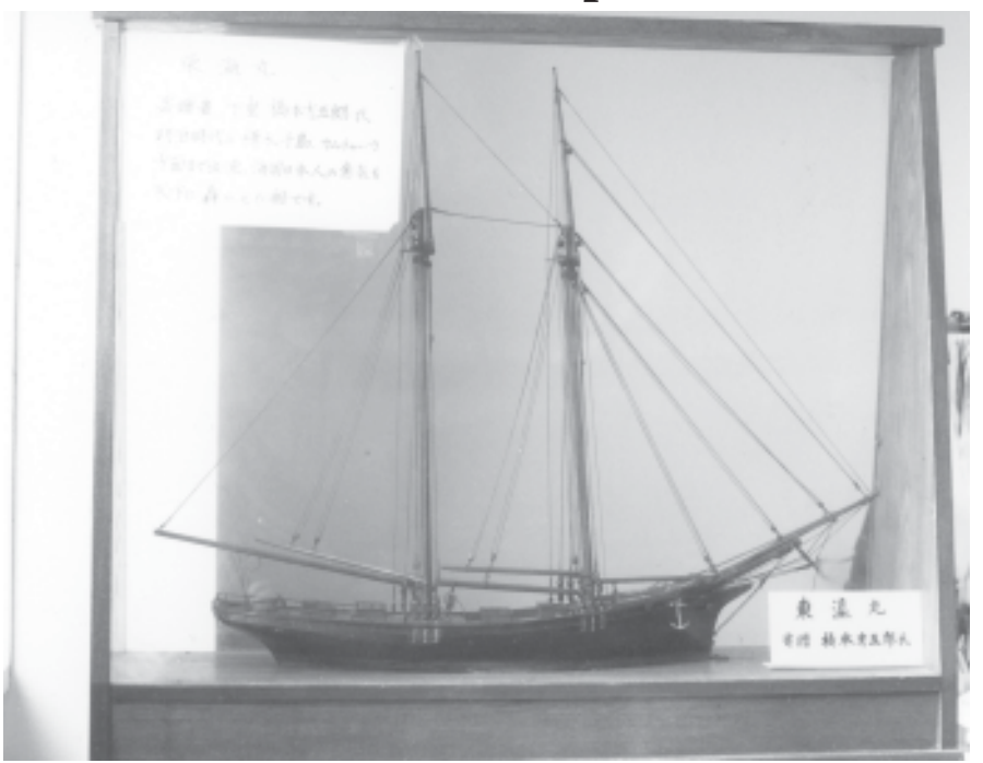
Model of the TOEI MARU in the Shimosato Elementary School.

Since the autumn of 1998, I have traveled to Japan on two occasions to visit my eldest sister. During these visits, I spent some time looking for information about my roots. I visited individuals, government offices and museums in Wakayama, Tokyo, Kanagawa and Shizuoka Prefectures, on an informal basis, searching for historical and genealogical information of immigrants to Canada. This article describes the information I gathered during my visits and my impressions of the best sources of information in Japan.