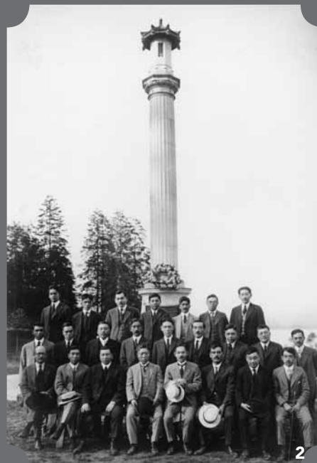
PHOTO ON PAGE 4: A group of Vets and the JC War Memorial Committee 70th anniversary of the cenotaph, Nov 11, 1990. NNM 1992.30.1