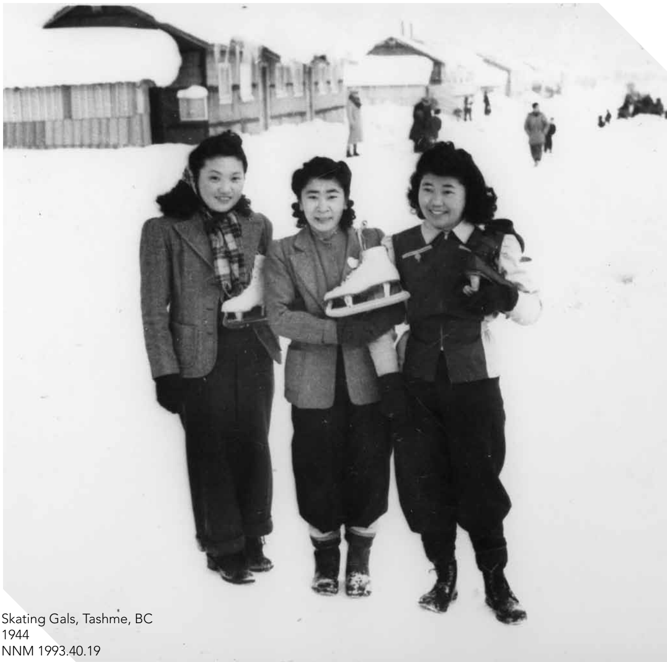
Skating Gals, Tashme, BC 1944 NNM 1993.40.19