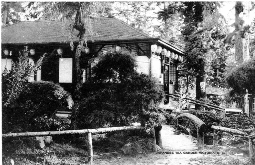
The main tea house, strung with lanterns, served afternoon tea to thousands of visitors every year from 1907 to 1942, between Victoria Day and Labour Day.