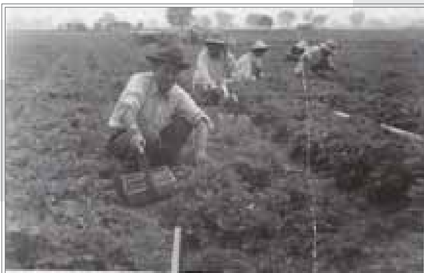
Norval, Ontario - picking strawberries