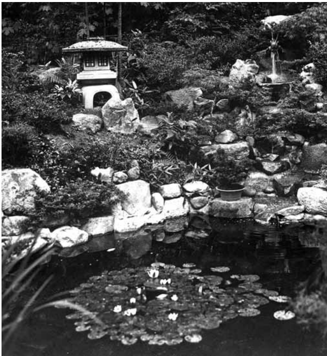
A typical pond at the Japanese Tea Garden. The lantern was imported from Japan, as were many of the trees and shrubs.