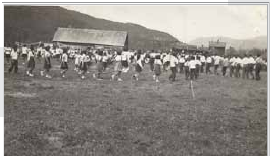
Lemon Creek - Sports Day