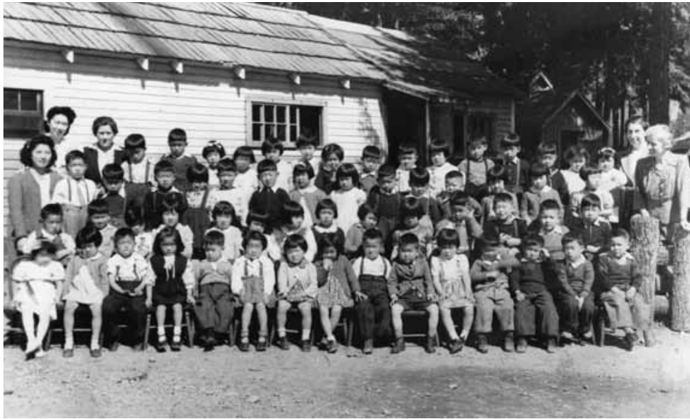
Tashme Kindergarten, c.1943.