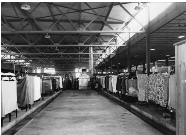
Women's Dorm in the Livestock Building NNM 1994.69.3.20