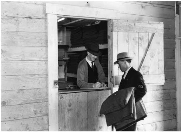
Distributing Blankets at Hastings Park NNM 1994.69.3.17