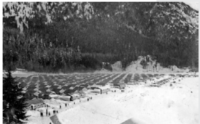
Above: Snowy row houses looking east and north, 1943. NNM 2012.45.1.12