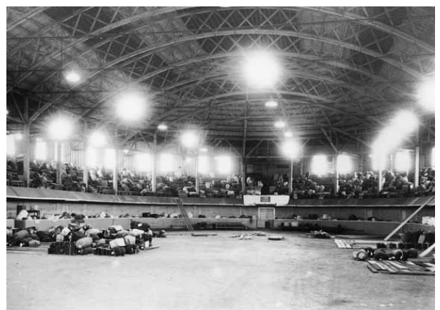
Baggage Storage Room NNM 1994.69.3.26