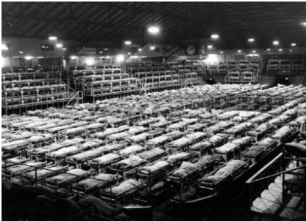
Hastings Park, Men's Dorm in the Forum NNM 1994.69.3.18