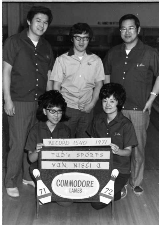
The Winning Team! 1971-72