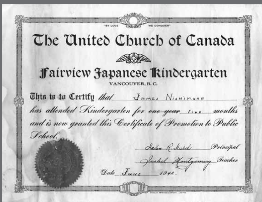
Kindergarten Certificate, 1942 NNM 2013.29.2.1