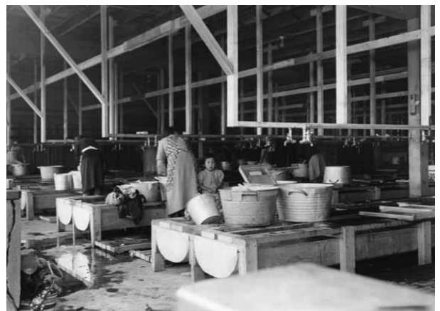
Laundry Room at Hastings Park NNM 1994.69.3.28