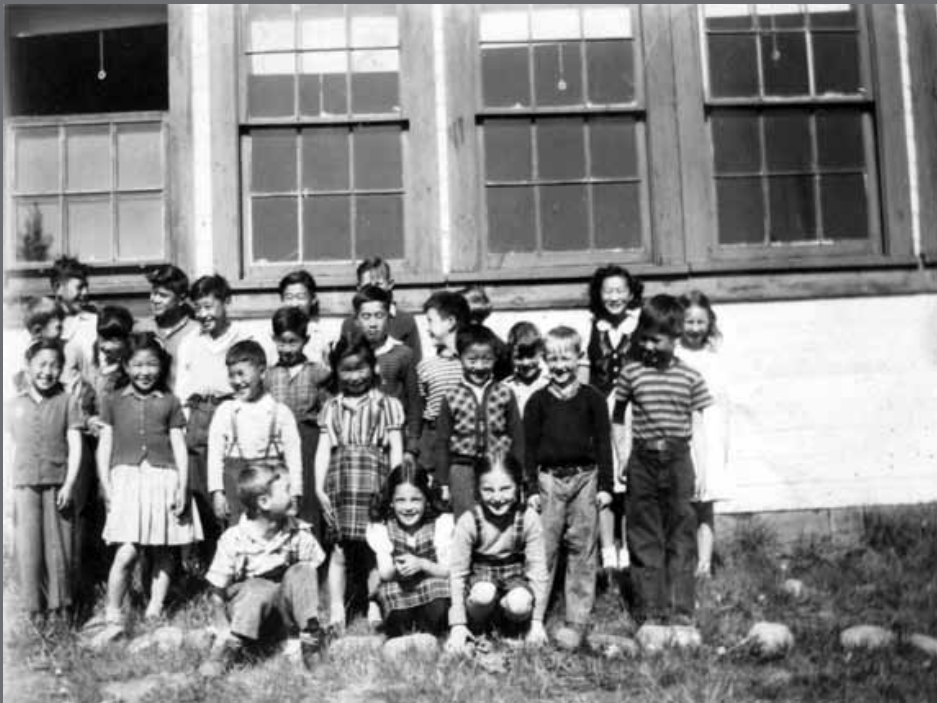
Brookmere School Children, 1946 NNM 2013.29.1.10