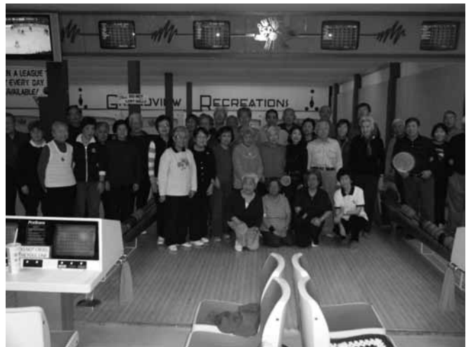
The Fuji League 2011-2012.

The Commodore also hosted the Senior City Men’s League, Vancouver’s premier men’s league. In March 1973, the nisei team established a league record “when they rolled a 4,393 series to come within 68 pins of