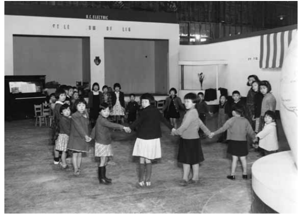
Hastings Park, Kindergarten NNM 1994.69.3.25