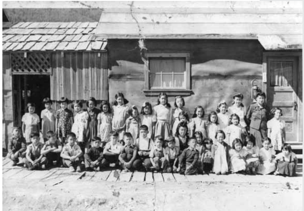
Japanese Language School at Tashme, c.1943.