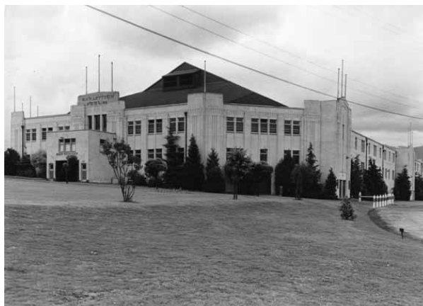
The Forum Building at Hastings Park NNM 1994.69.3.3

My stay in Hastings Park was rather carefree as I was young. However, I can imagine the many hardships a mother with children had to cope with everyday, without the aid of relatives and friends. These women deserve a hearty round of applause!