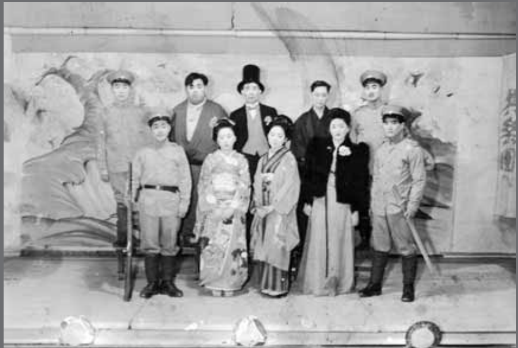
Concert at Tashme, 1943

Later on I was befriended by a couple of white guys with whom I played soccer, baseball, and boxing. The Japanese Judo Club started at the Japanese Language School in the early 1950s and I got to meet many Japanese Canadians boys as we had tournaments in