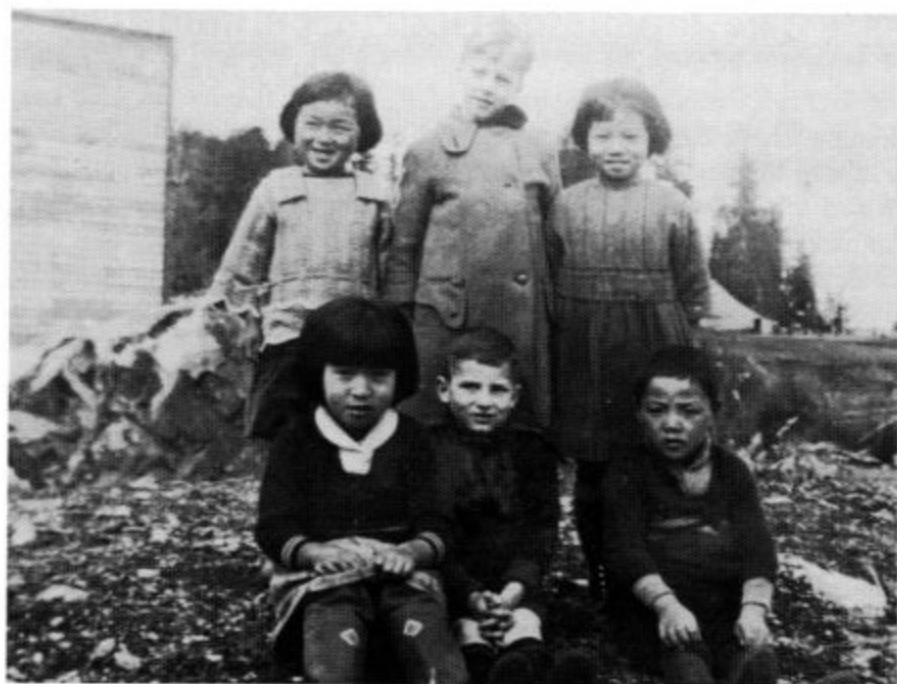
Ucluelet Children, Madden's Store.

There was a mail boat service from Port Alberni twice a week, Mondays and Fridays. The CPR Steamships PRINCESS MAQUINNA and PRINCESS NORA called at Ucluelet the 1 st and 20 th of each month on her way to Port Alice in the north. This is the ship that brought the groceries and fresh meat to the stores. Housewives flocked to the stores to buy