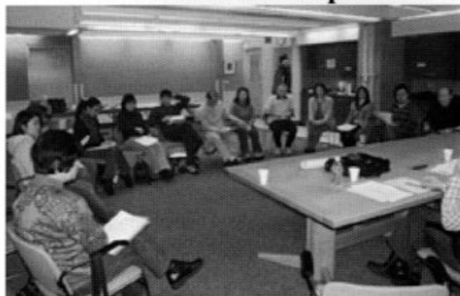
General meeting of the Japanese Canadian Association of Yukon held on February 1st, 2009.

About twenty Japanese Canadians met in Whitehorse, Yukon, to form a new organization, and decided to call this group Japanese Canadian Association of Yukon. There have been numerous social gatherings of the same group of people in the area for over ten years. In view of a recent participation of Japanese Canadians at the Herit-