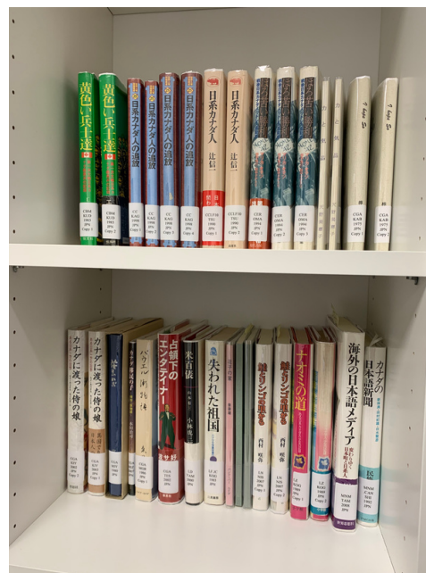
Image caption: Keiko Kaneko completed the cataloguing of our Japanese-language library publications classified using our Japanese Canadian Classification Scheme. Aira Ng, practicum student from Langara College, completed the rehousing and reorganization of our library publications.

Additionally, less than 10% of the funds were allocated to complete a mini storage renovation project allowing us to extend our compact mobile units from Hi-Cube Storage. The new units help us maximize our storage space and provide us with double the storage capacity on our mobile units.