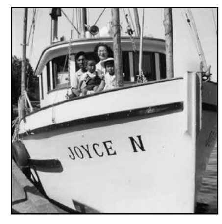
Ucluelet Fishing Company and Japanese Canadians in Ucluelet Page 4