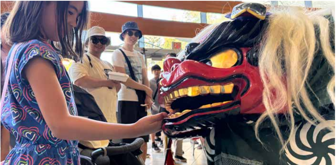
The Rakuichi mikoshi group entertains visitors with shishimai during the Nikkei Garden Farmers Market, Jun 9, 2024.

Visitors enjoyed a day of shopping for nikkei treasures and foods at the annual Spring Bazaar on May 11. The event featured Japanese plants and trees, including freshly picked fuki. This year, NNMCC Members were treated to priority access to the flea market before the crowds, where they discovered Japanese items such as dolls, fans, dishes, kimono, and more from various vendors. Customers eagerly lined up for foods made by the NNMCC Auxiliary members, including manju, anpan, ohagi, chirashizushi, inari, onigiri, and gyoza. Attendance: 2,000.