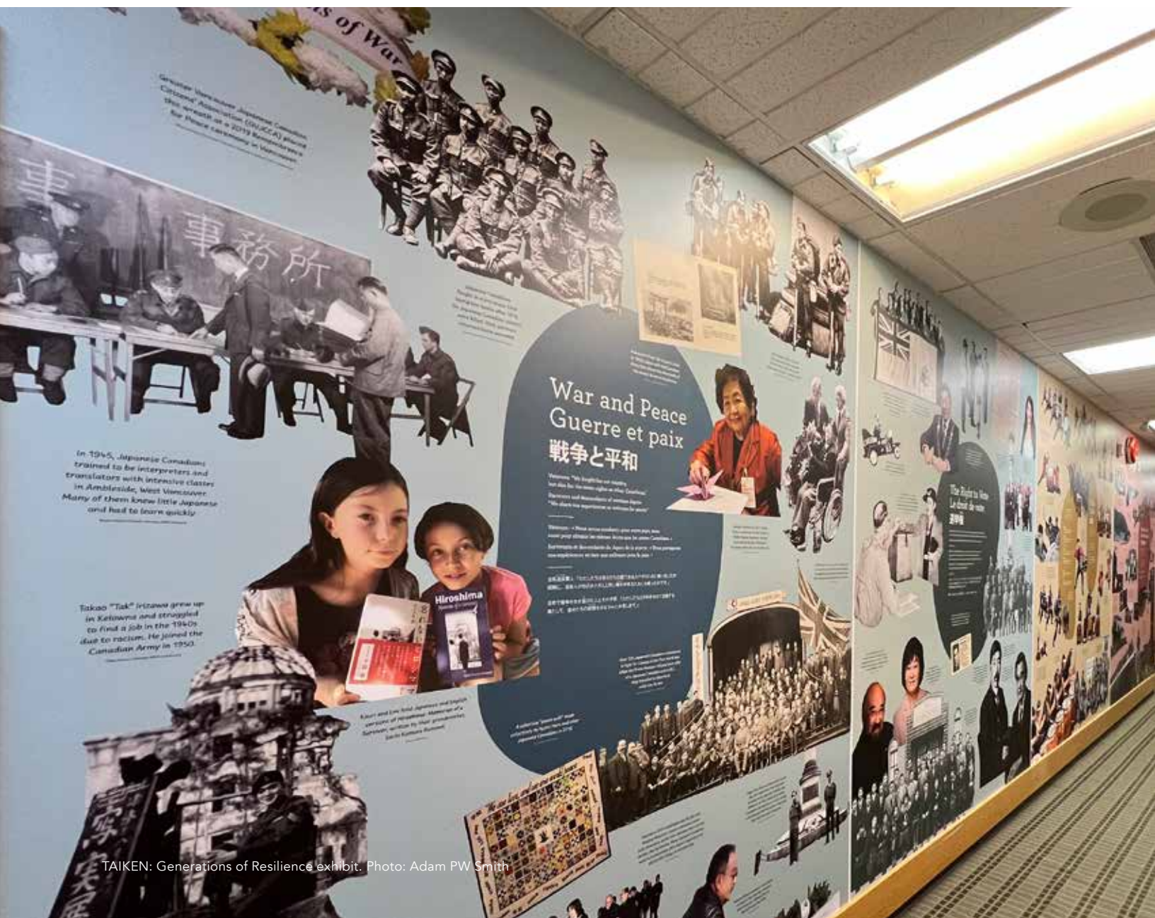
TAIKEN: Generations of Resilience exhibit.