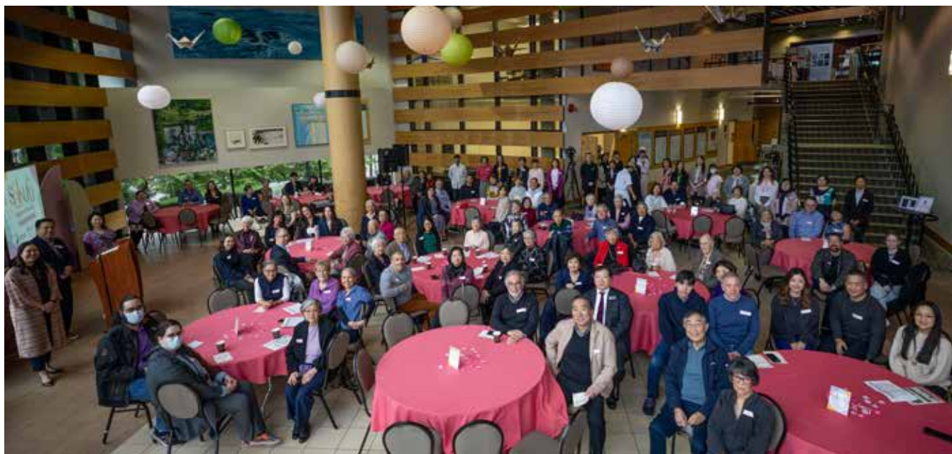
Sakura Appreciation event on March 9, 2025.