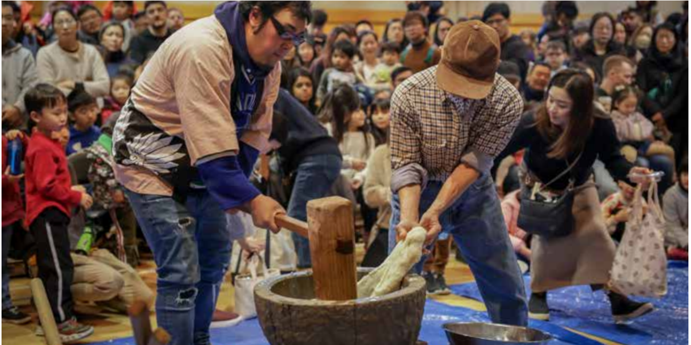
Mochitsuki demonstration by members of the Vancouver Japanese Gardeners Association, Dec 29, 2024.

The annual Nikkei Mochitsuki took place on December 29 as usual, featuring a live mochitsuki demonstration by the Vancouver Japanese Gardeners Association, vibrant performances by Chibi Taiko, Satsuki Kai, and Vancouver Okinawa Taiko, and the tireless efforts of the NNMCC Auxiliary who provided fresh mochi to be savored by the crowds. Attendance: 2,000.