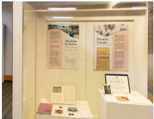
The Women of Change exhibit.

Long-term exhibit Women of Change: Celebrating Japanese Canadian Leaders also continued.