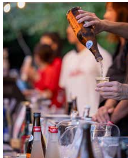
Zenyasai ~ kick starting the night before Nikkei Matsuri pre-party with DJs in the garden.