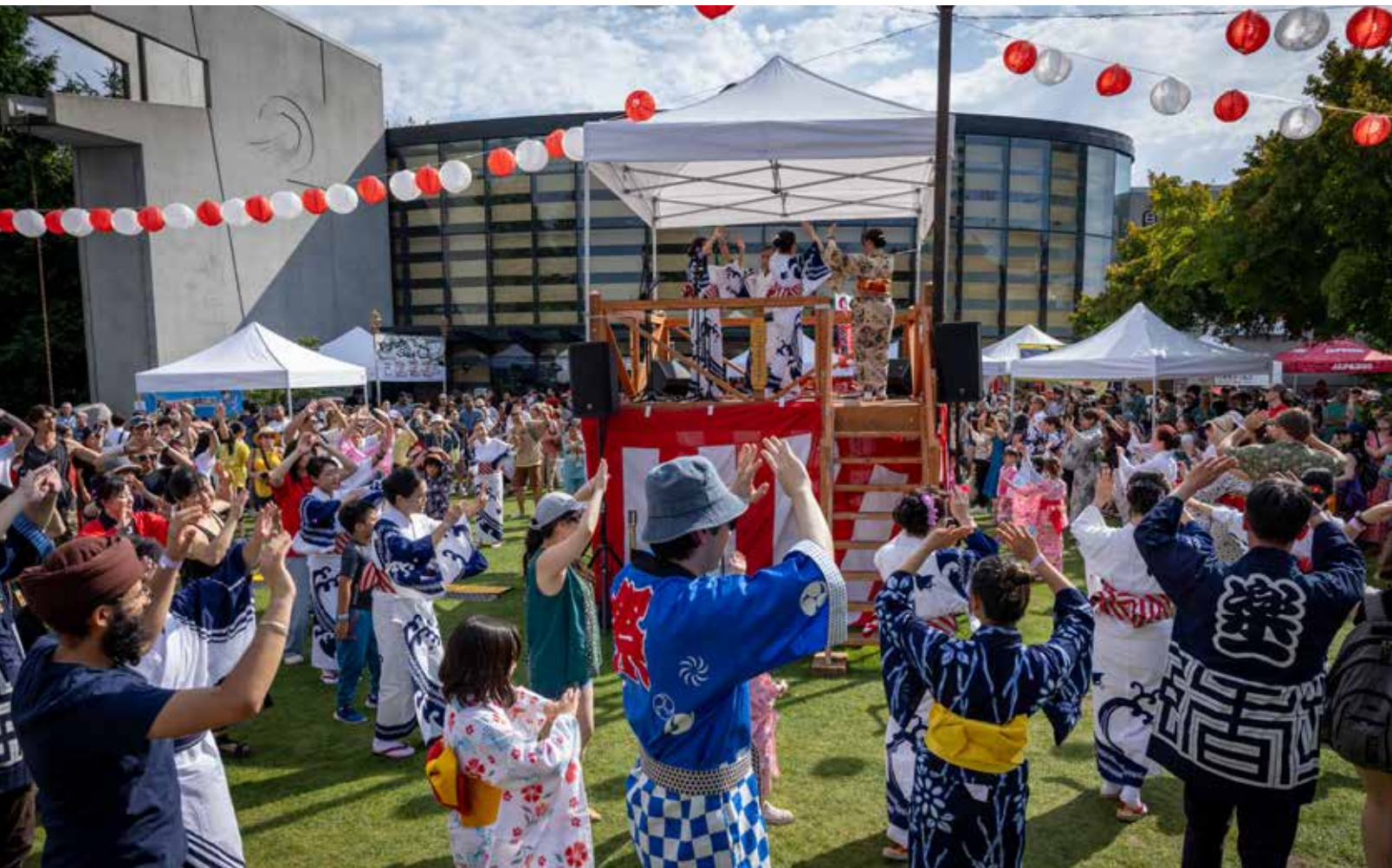
Bon odori at the Nikkei Garden lead by Satsuki Kai dance troupe during Nikkei Matsuri, Sep 1, 2024.