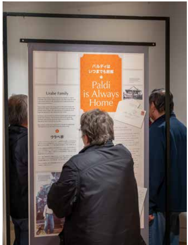
Haq & History exhibition opening, Nov 2, 2024.

This travelling exhibit originating from the South Asian Studies Institute (SASI) and the Royal British Columbia Museum (RBCM), presented the experiences of South Asian Canadian immigrants in British Columbia. NNMCC contributed research on the intertwined histories of South Asian and Japanese Canadian families in Paldi, integrating a Nikkei perspective and expanding the exhibit's content.