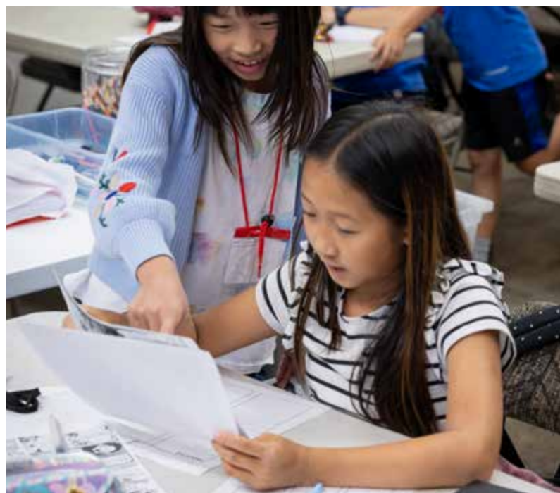
Summer Manga Camp.