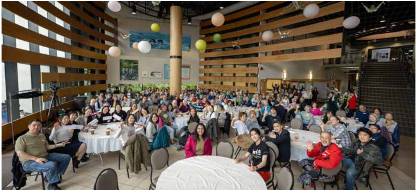
Volunteer appreciation lunch event on June 1, 2024.