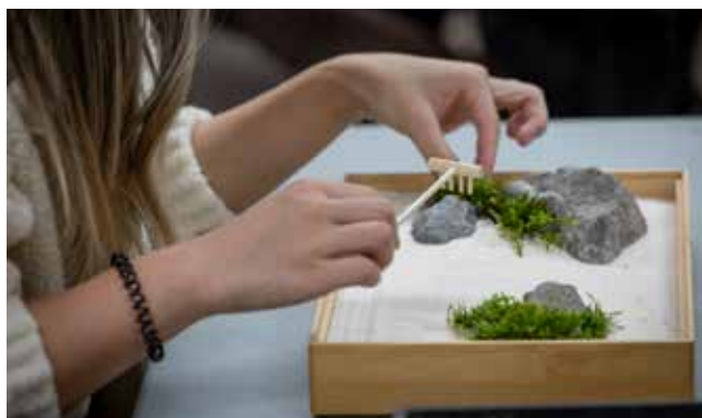
The Vancouver Japanese Gardeners Association presented a karesansui workshop, Nov 2, 2024.