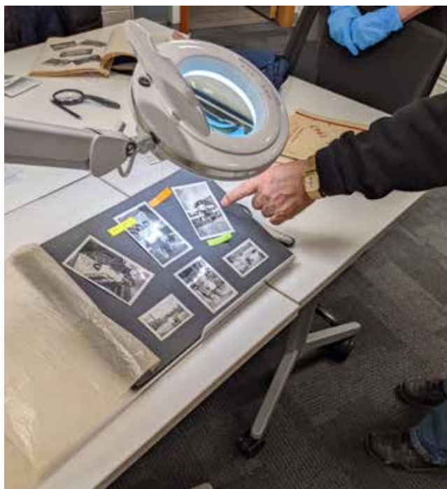
The Charles H. Kadota Resource Centre is open to community members and researchers and includes a self-serve reference library, subject files, and knowledgeable staff that facilitate access to the collections in our archives. Here, community members look through a photograph album to help identify names, locations, and dates in the Charles H. Kadota Resource Centre. 12 February 2025.