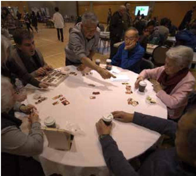
A lively gaji game taking place during the inaugural Oshōgatsu event, January 4, 2025.